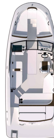
Optional Port Lounger w/ Convertible Backrest